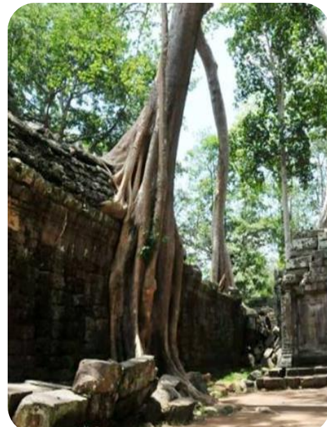
Day 03 - Siem Reap Temple Tour (B/L)

Start off by visiting the world famous temple, Angkor Wat. Angkor Wat, a World Heritage Site since 1992, famous for its beauty and splendor, features the longest continuous bas-relief in the world which runs along the outer gallery walls and narrates stories from Hindu mythology. It was built during early-mid 12th century by King Suryavarman II; it took about 35 years to complete the massive construction. Continue visiting one of the area's most beautiful temples, Ta Prohm (mid- 12<sup>th</sup> – early 13<sup>th</sup> century). Intentionally left partially unrestored, massive fig and silk-cotton trees grow through the towers and corridors offering a 'jungle atmosphere' and some of the best 'tree-in-temple' photo opportunities at Angkor. Today lunch will be at The Khmer BBQ Restaurant. The meal features arange of starters (Green papaya salad with crispy fried shrimp, fresh vegetable spring roll with shrimp and Pineapple salad with chicken), followed by a main course of 'BBQ Phnom Pleng' (5 kinds of meat: beef, pork, chicken, crocodile and squid) to be cooked/grilled at the table using a traditional Cambodian Stove. And last but not least, seasonal fruit platter for dessert.